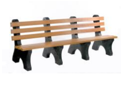
8 ft central park