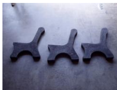
Central Park Bases