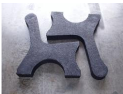
Recycled Plastic Bases