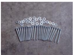
Central Park Hardware