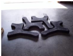
Recycled Plastic Bases