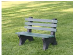
4 Ft Central Park