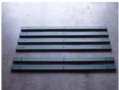
Central Park Slats